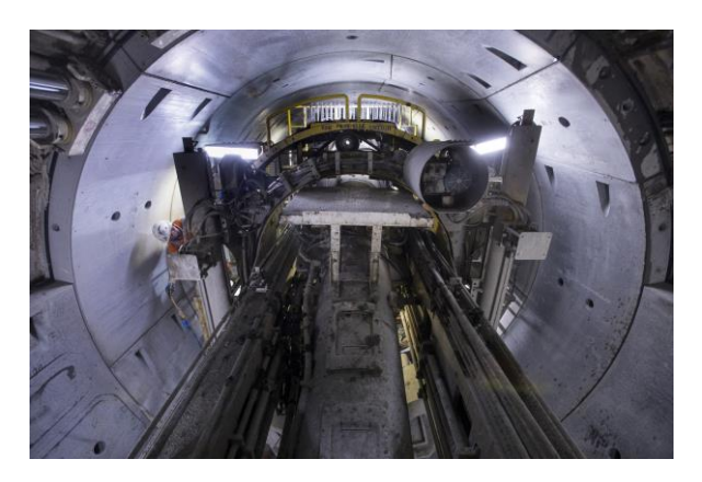
Above – inside the Tunnel Boring Machine

Working hours for tunnelling and surface tunnel support are now 24 hours/7 days a week. We do everything we can to minimise night time noisy works. This will include deliveries arriving to site between 07:00 and 20:00 Monday to Saturday and the barge movements 24/7 during the tunnelling period to remove excavated material.