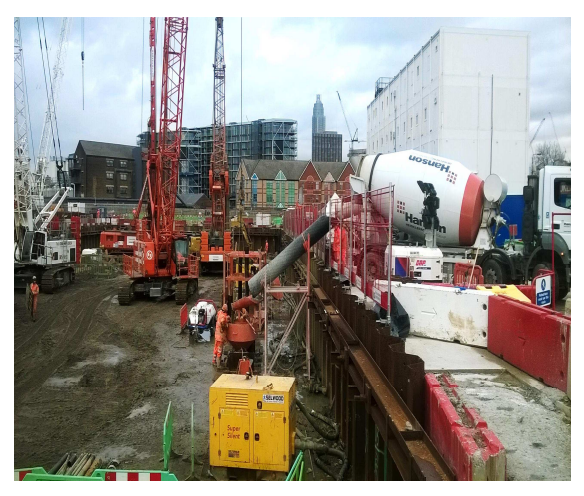
An example of a concrete pour taking place