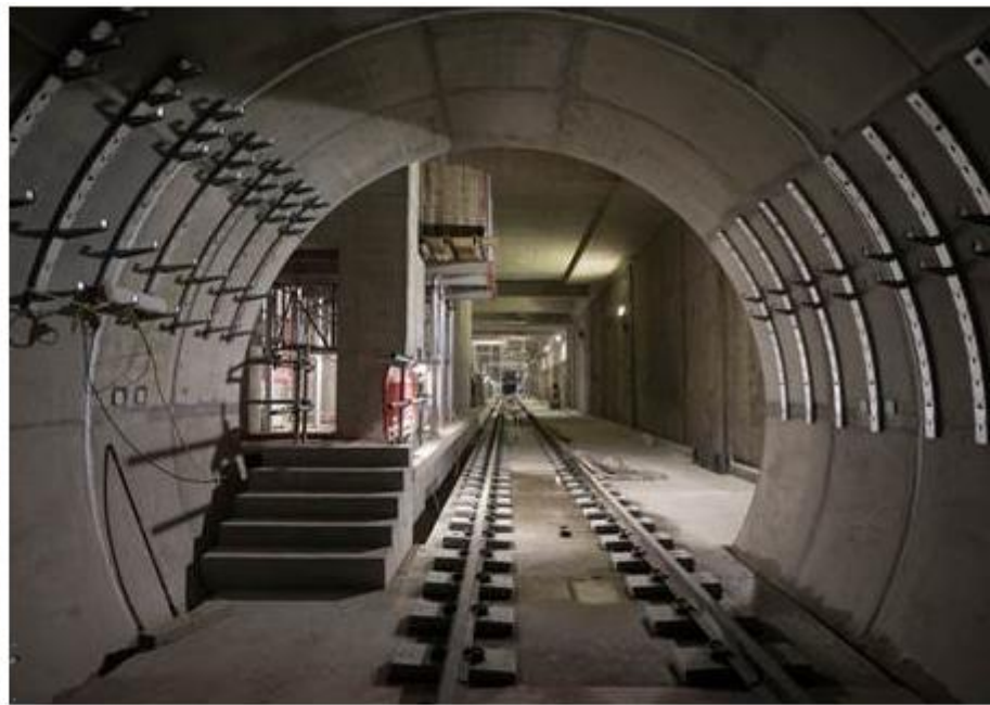
Fig 1. The western core structure