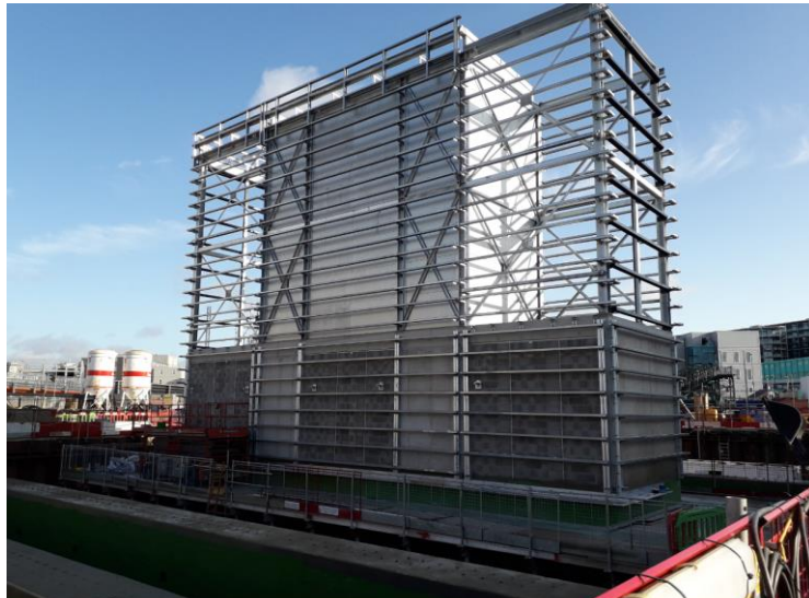
Fig.2 Steelwork at the entrance to the station