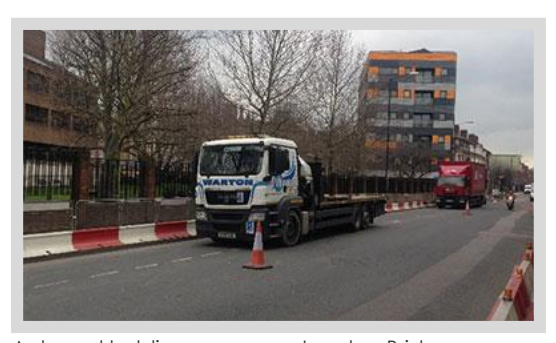
A shared holding area near London Bridge Station.