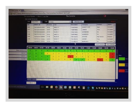
DataScope delivery schedule interface.