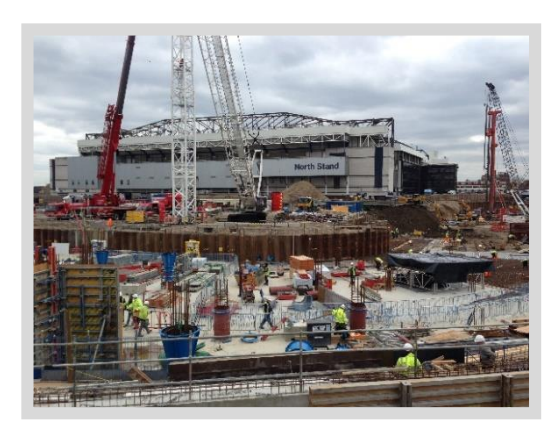
White Hart Lane new stadium.

High profile construction projects in London and the South-East (Crossrail, 2012 Olympics, Heathrow T5) can do much to promote new initiatives throughout the construction logistics sector, in particular with their commitment towards DMS and acquisition of truck holding areas. However, processes managing the identification, approval and funding of truck holding areas need to be structurally improved in order to generate greater clarity and better provision of suitable areas. As with DMS, the need for holding areas in London will become increasingly acute.