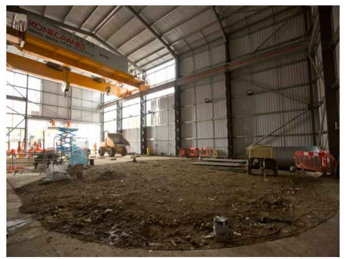
Shaft area ready for excavation.