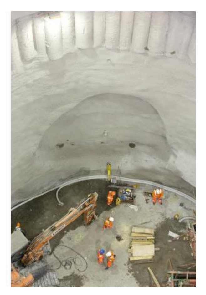
Three images of the Kennington Green Acoustic enclosure shaft. August 2016