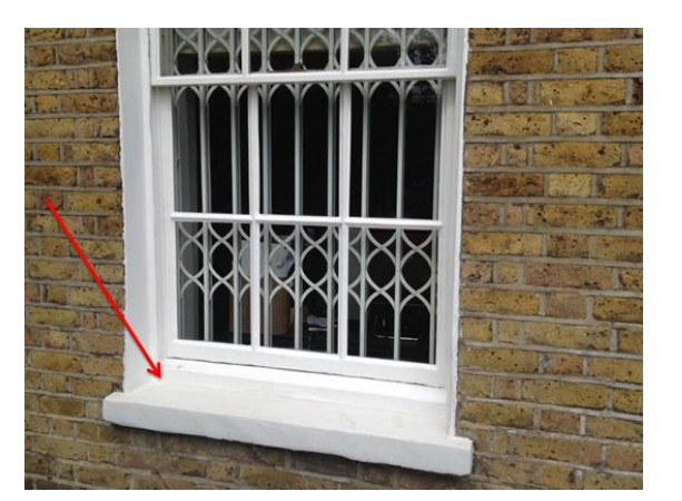
Figure 5 – Glass Slide 2

Location: front window of 350 Kennington Road Receptor: residents of Kennington Road (North NLE worksite)