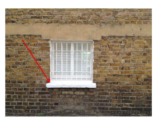
Figure 4 – Glass Slide 1