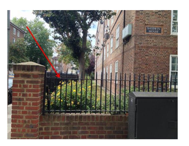
Figure 8 – Glass Slide 5