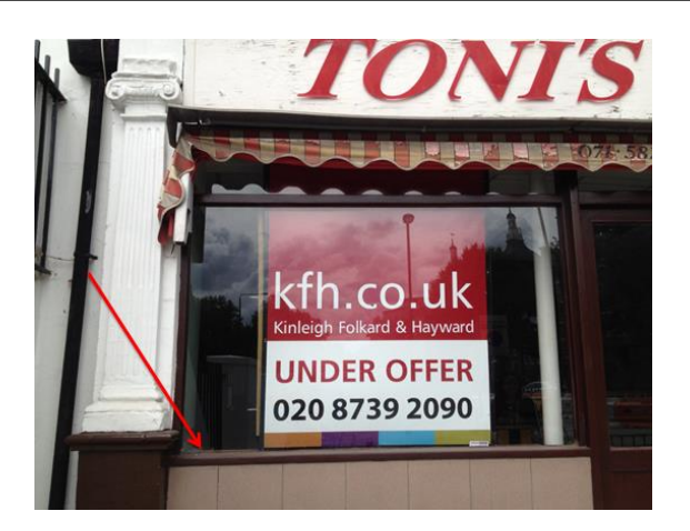
Figure 6 – Glass Slide 3

Location: front window of Toni's Café (344 Kennington Road) Receptor: residents of Kennington Road (North-East NLE worksite)