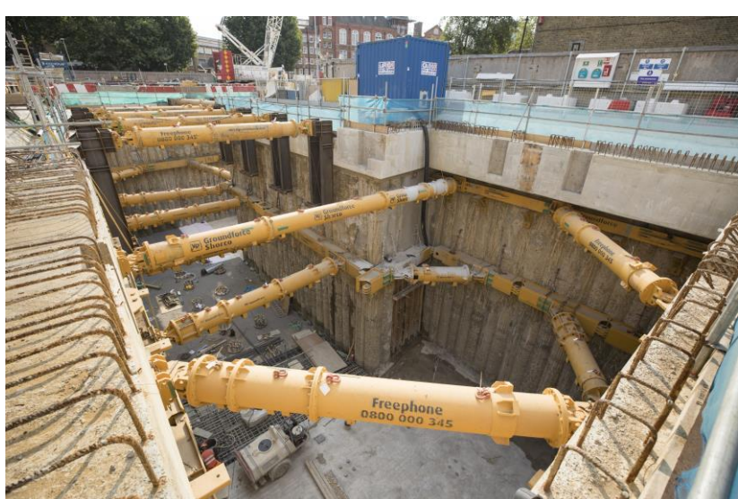
Above –Excavation of main site at Kennington Green July 2018