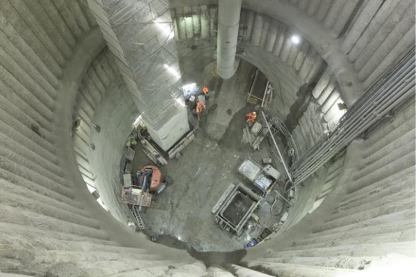
Illustration of the adjacent new tunnel to the existing loop and a current picture of the Kennington Park Shaft.