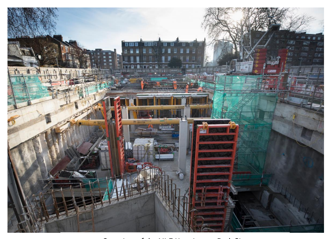
Overview of the NLE Kennington Park Site

Basement excavation is now complete and the temporary propping system to support the structure whilst under construction, has been removed. See the image below showing the overview of the site, now minus yellow propping.