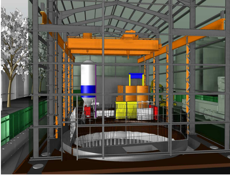
Illustrations of the gantry crane installed inside the acoustic enclosure

The full process of the installation of the acoustic enclosure and delivery of the crane will be carried out as efficiently as possible using best practicable means to complete the work. You may hear hand tools being utilised to secure the steel-framed structure. You will also see cranes and scissor lifts moving around the worksite.