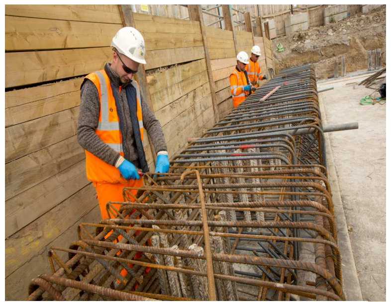
Preparation of the reinforcement cage for concreting