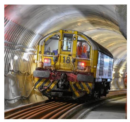
Fig. 2 First engineering train to cross NLE tracks