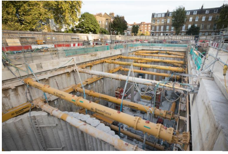
Fig. 1 Basement excavation and shaft at Kennington Park

October saw a big milestone in the project when the first engineering train crossed over the new Northern Line Extension tracks. (See fig.2 below). These trains are being used to deliver sections of rail to complete the final stretch of track installation between Kennington and the future Nine Elms Station, (we have completed 150m at the Kennington Park site so far). This operation is helping to remove a number of heavy lorry movements from the road network in the area.