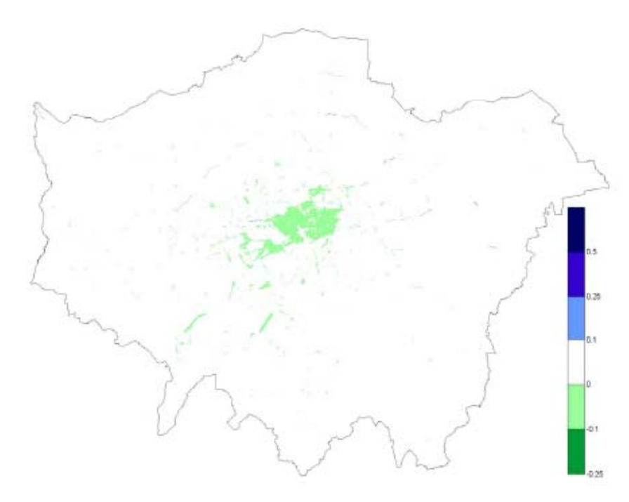
Figure 2: Deferral of LEZ Phase 3 from October 2010 to January 2012: Predicted impact on number of daily mean exceedences of PM_{10} in 2011 (number of days)

The impact of deferral of LEZ Phase 3 in other years has been assessed based on changes in emissions of PM_{10} . The LEZ updates the stock of vehicles in the fleet bringing forward the introduction of newer, less polluting vehicles. However, because of the natural turnover of the vehicle fleet over time, the benefits of the LEZ are higher in the early years following introduction, but then decline in the later years relative to the baseline, because of the improvements that would have occurred anyway in the fleet (even without the LEZ in place). The decline in relative benefits means that, by 2015, the additional benefits of the scheme over and above those that would have happened without LEZ are negligible.