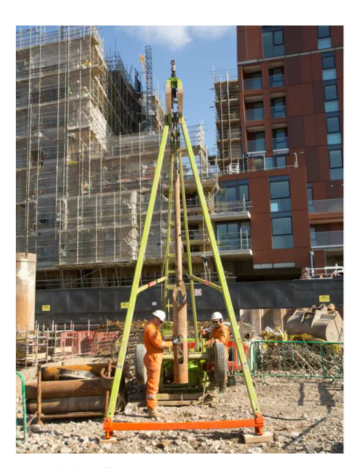
Bore hole drilling activity