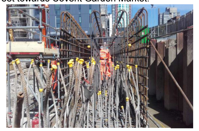
Steel cage reinforcement for capping beam installation

The guide wall removal is taking place at the same time as the construction of the capping beam. This is where a steel cage is strategically placed over the existing piles and interlocks with the rebar (Please see image below). These cages are then encased in concrete to produce the capping beam. This will structurally connect all of the formed piles, provide ground support during excavation and help to equally distribute the future load of the OSD. The construction of the beam will follow the same line as the perimeter wall, progressing from the Wandsworth Road end of site along Pascal Street towards Covent Garden Market.