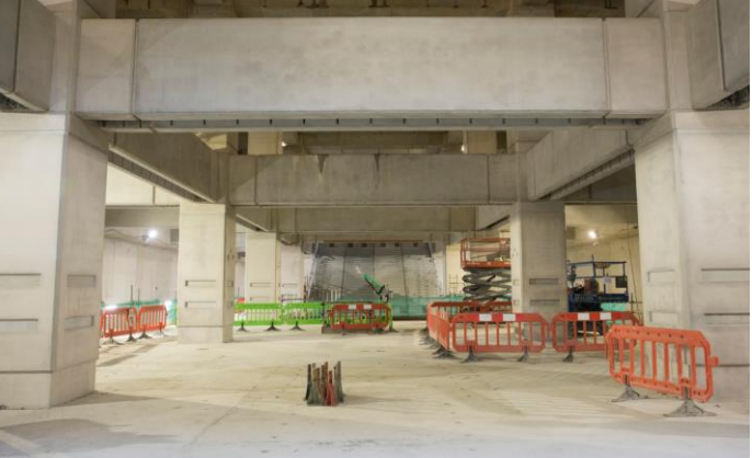
Fig.1 The platform at Nine Elms Station with the tunnel entrance in the distance complete