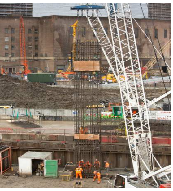
The Diaphragm wall cage being inserted

Bored piling and plunge column installation have also commenced in the Crossover Box with crawler cranes and piling rigs working together. Piling is essential to ensure the stability of the foundation when excavation commences. The plunge columns (steel beams) are lifted by crane and installed inside a number of the piles. They are used in basement excavation and will assist in supporting the over site development. Please note that due to the size of the steel plunge columns and accompanying crane, deliveries need to be carried out outside of core working hours in accordance with Highways Authorities' regulations and as instructed by the Metropolitan Police. We will advise the community when this is due to take place.