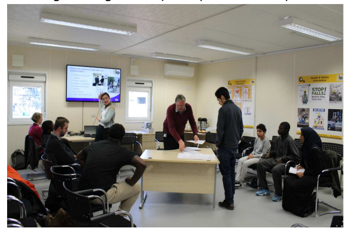
A presentation being delivered to the Talent Match group

As part of a week-long TfL employability supplier event at the end of February, the NLE hosted an event called "Talent Match" at our Battersea NLE site office for a group of unemployed young people. A variety of activities were prepared to give the group an insight into the abundance of career opportunities within the Civil Engineering industry. They then had to present back what they had learnt and produced a video.