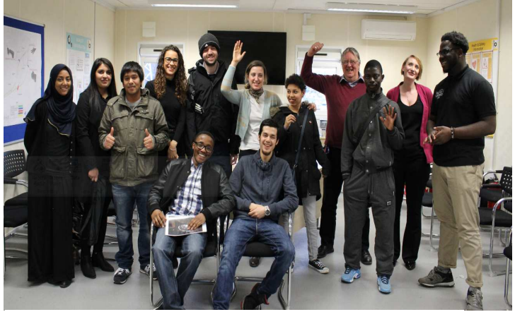
Some of the participants Talent Match group

nle@tfl.gov.uk 0343 222 2424 tfl.gov.uk/northern-line-extension