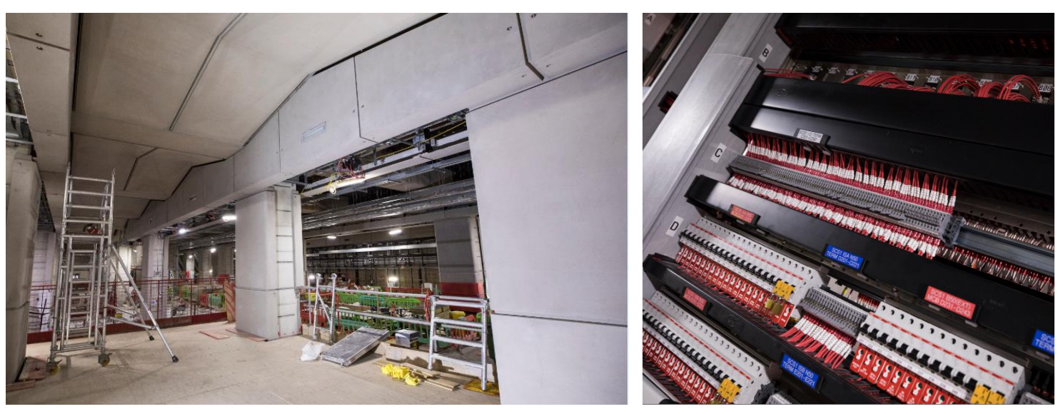
Fig 3. Cladding and tiling at ticket hall level

'Fit out' of the station finishes will continue with wall cladding and tiling in the ticket hall area and at platform level, (see fig. 3 below) along with finishes to the back of house accommodation and plant areas. Mechanical & Electrical (M&E) installation remains high priority for the station to reach the next major milestone - switching on the track power.