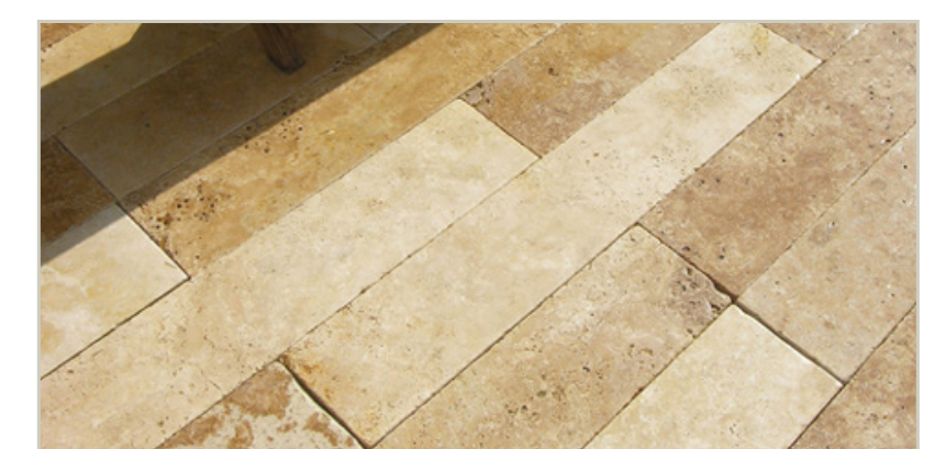
Limestone (feature entry paving)