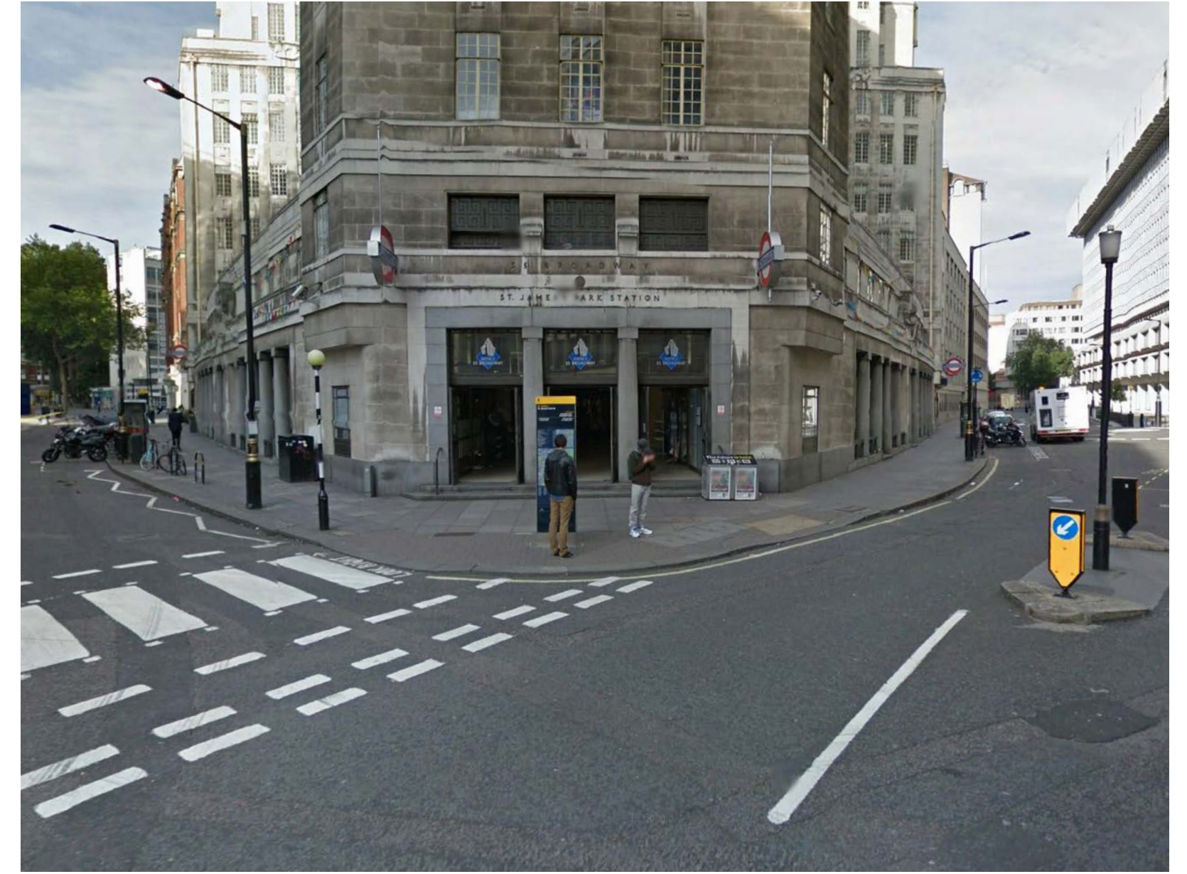
Existing public realm does not celebrate the entrances to 55 Broadway