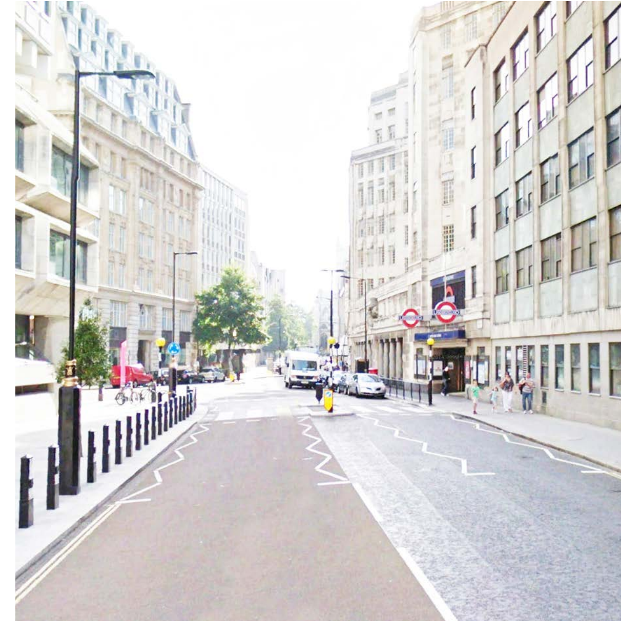
Vehicle dominated street scene towards Broadway