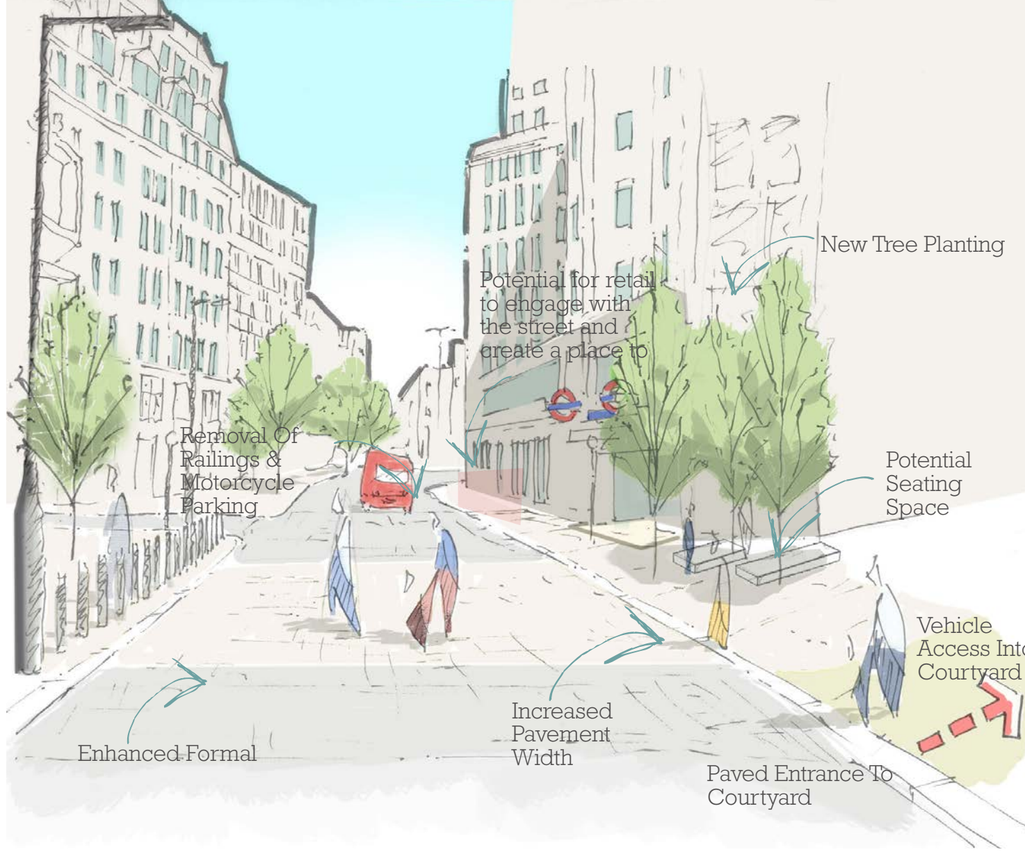
Sketch illustrating public realm enhancements to create improved pedestrian environment