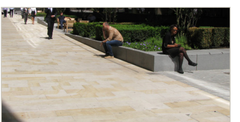
Warm Granites (crossovers and raised pads)