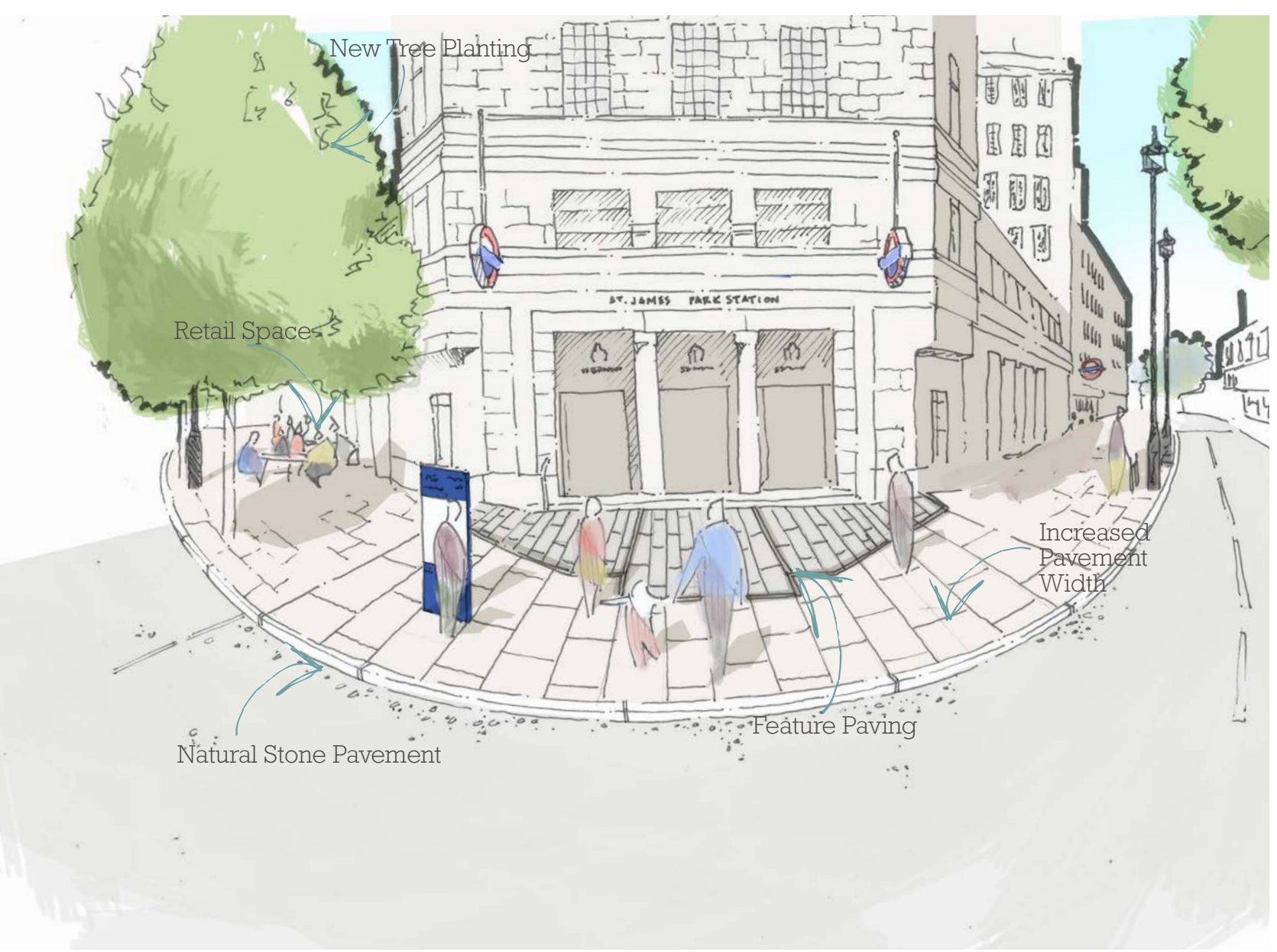
Sketch illustrating the potential enhancements to the northeast entrance to 55 Broadway