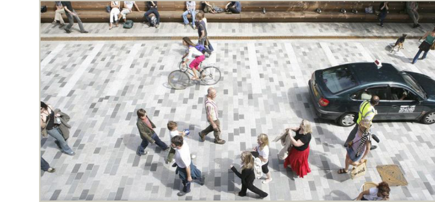
Mixed Grey Granites (St Ermins Hill)