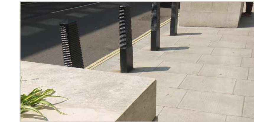
Artificial Stone Paving (surrounding pavements)