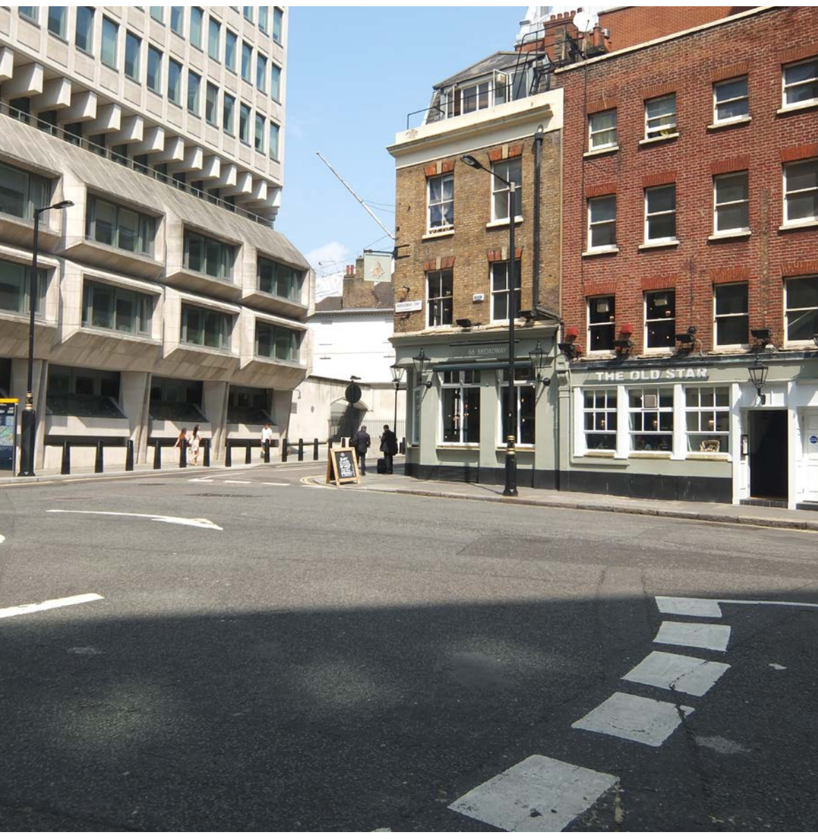
Vehicle dominated space to key entry/arrival node to Queen Anne's Gate