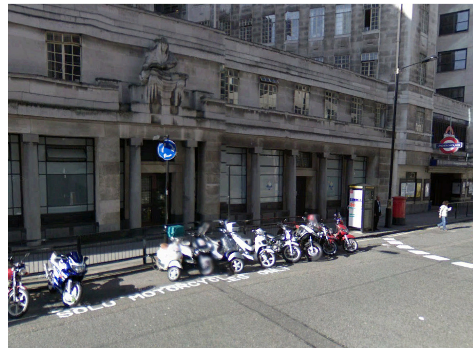
Clutter detracts from key building elements