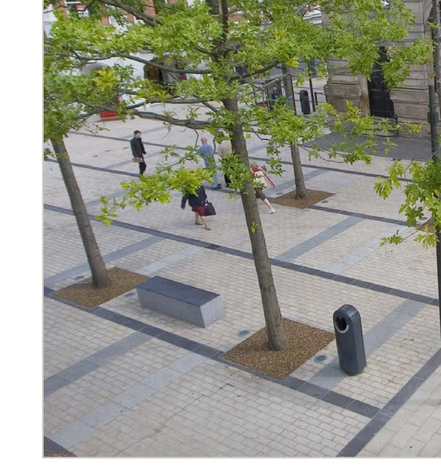
Additional Tree Planting (streets and spaces)