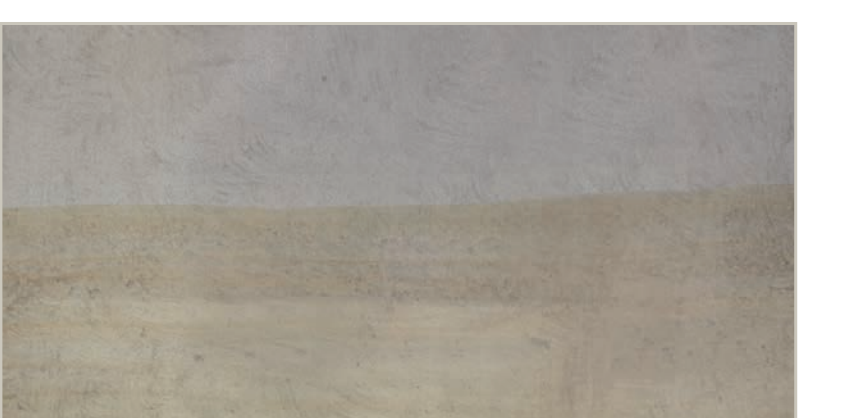
English Pennine Stone (pavements adjacent to 55 Broadway)