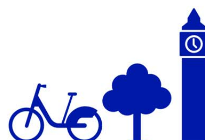
Fig 4 – most popular trips