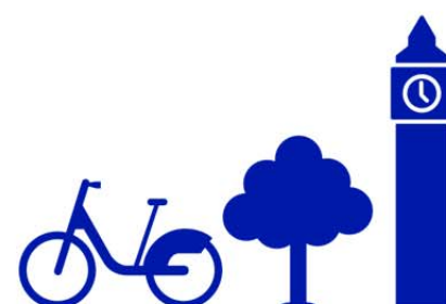
Fig 7 – Period dates