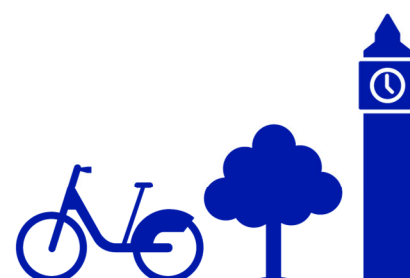
Fig 5 – member summary