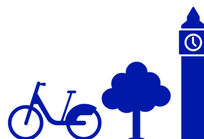
Fig 2 – monthly hires