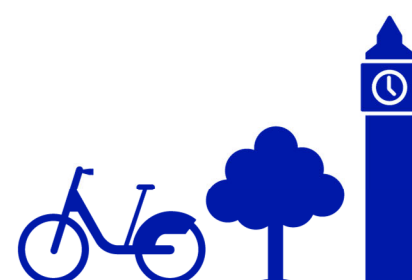
Fig 7 – Period dates